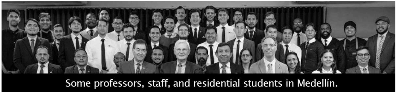
Some professors, staff, and residential students in Medellín.