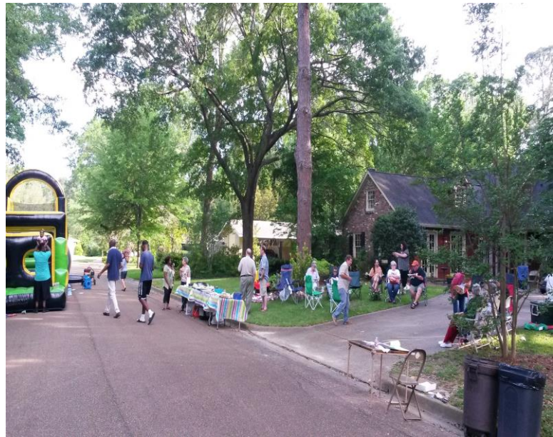
(Spring 2016 Briarwood Terrace Gathering)

There have been some highlights this past year; first the Briarwood Terrace Community Picnics held in April and Oct. These are bring a dish to share at a 3 hour neighborhood get-together of the folks in our development. The October one was held at our house and some 62 families came, heard a blessing of the meal and we also got to share a lot about church building, Christ and much more. I have been asked/tasked with building a sign for the entrance to the subdivision and three "little lending libraries" for the neighborhood.